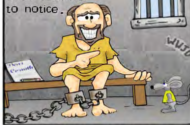
The Apostle Paul, too wrapped up in his love for God to notice his own problems. THAT'S A NICE PROBLEM FOR LIFE.

Come to mention it, I guess I was blinded, beaten, ship-wrecked, and imprisoned... I guess I was TOO BUSY SERVING to notice.